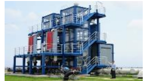
Ocean Thermal Energy Conversion